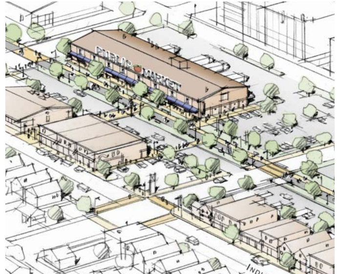
Rendering of the Indiana Avenue Revitalization Proposal