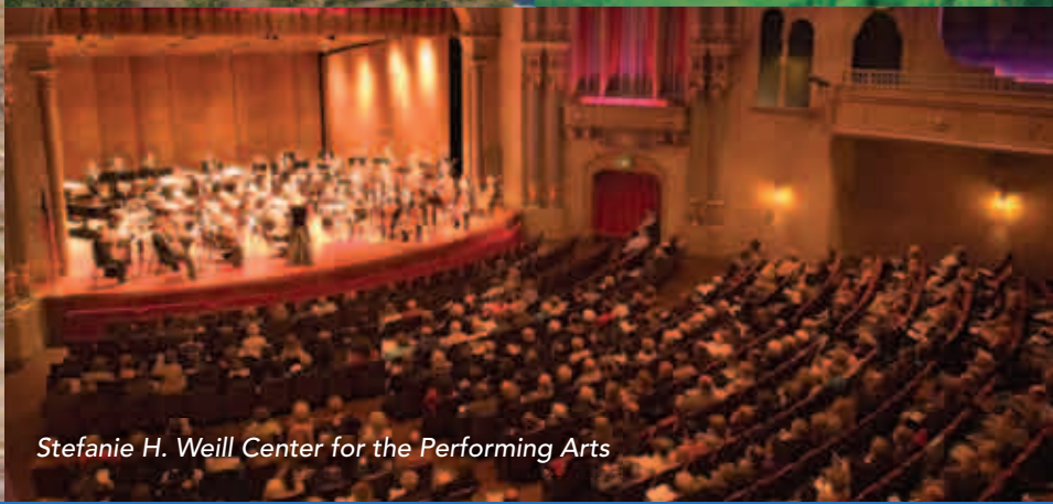
Stefanie H. Weill Center for the Performing Arts