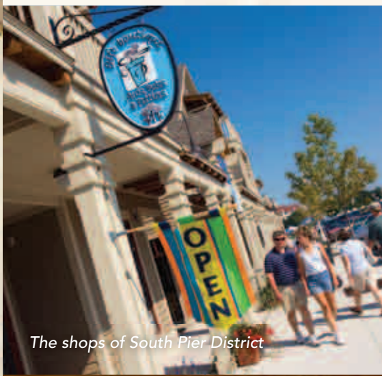
The shops of South Pier District