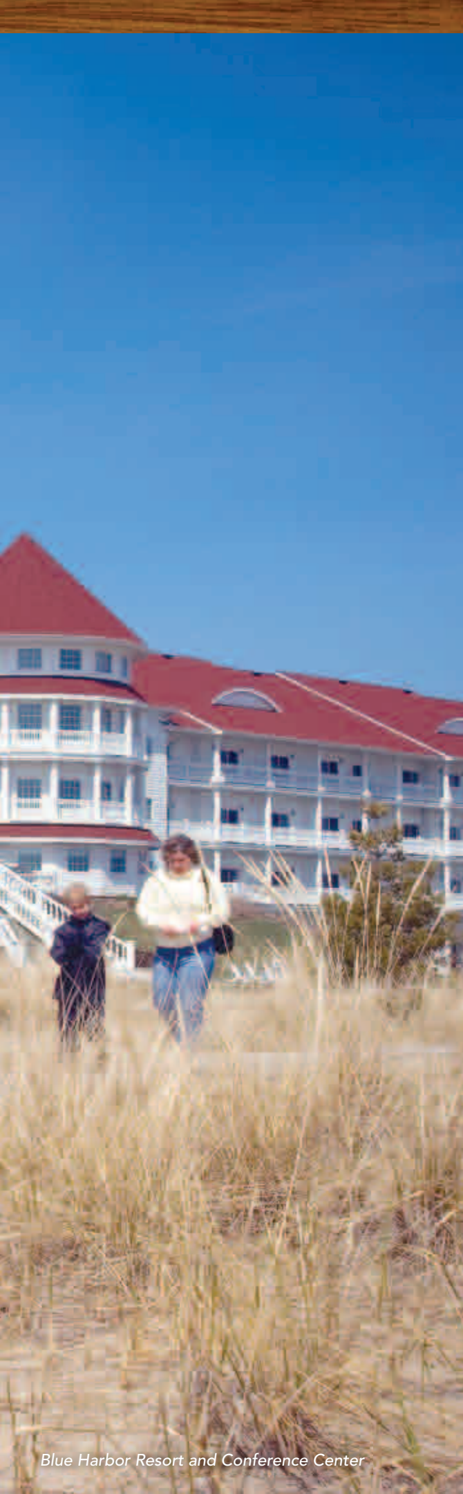
Blue Harbor Resort and Conference Center

Enjoy the serenity of the South Pier District and the Fish Shanty Village Riverfront Boardwalk. Enrich your stay with the enchantment of the John Michael Kohler Arts Center, theaters, museums, antique shops, and charming B&Bs. There is always something fun to do with a variety of events and activities such as music festivals, boating, biking and the Blue Harbor Resort water park. Sheboygan also offers the excitement of Lake Michigan charter fishing, world-class golf and world-cup sailboat racing.