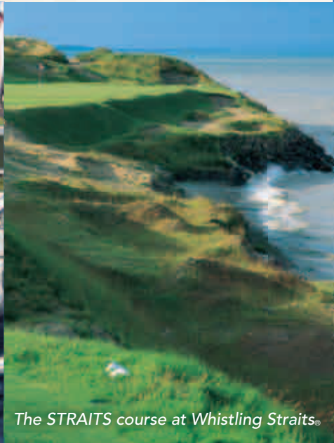
The STRAITS course at Whistling Straits®