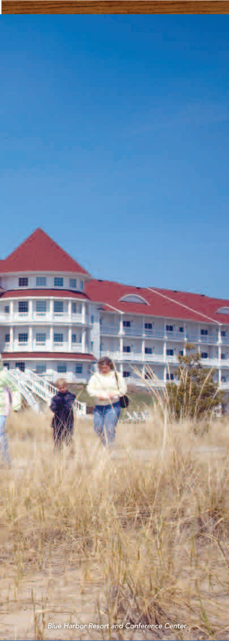
Blue Harbor Resort and Conference Center