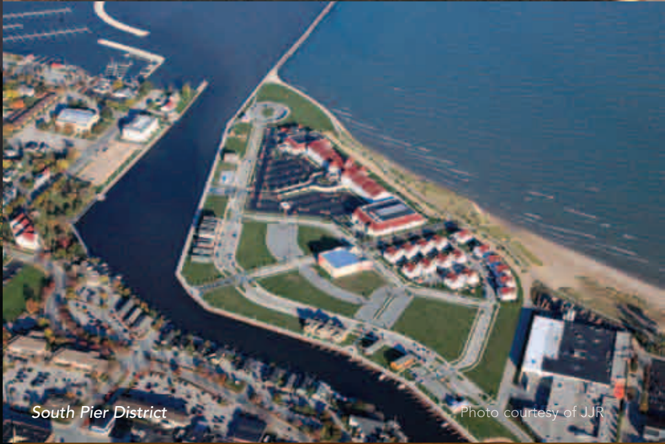
South Pier District