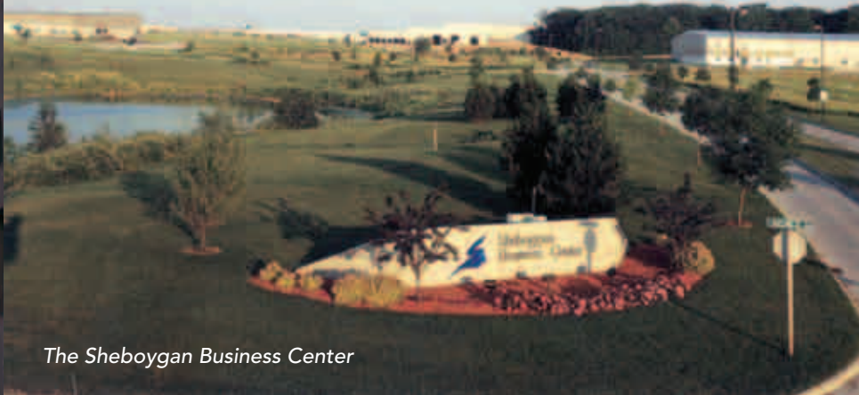
The Sheboygan Business Center